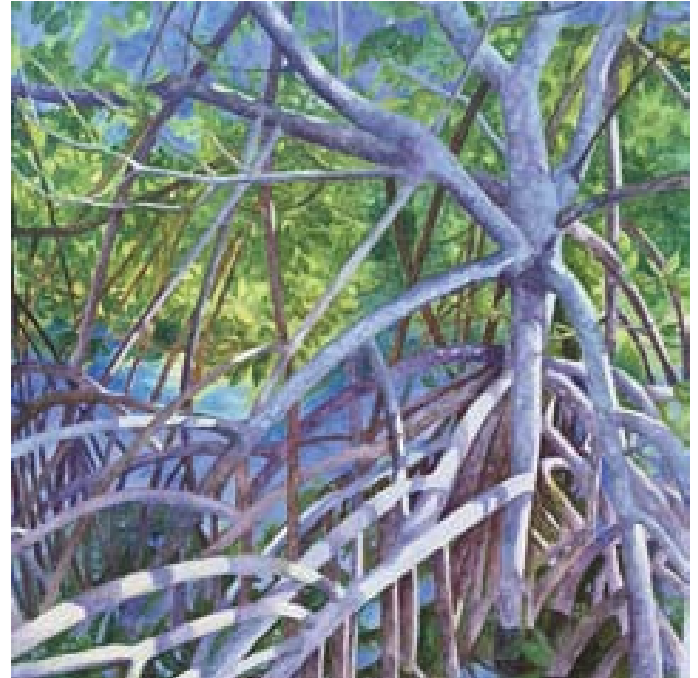
Mangroves by Ricardo Aberle

Colors: cobalt blue, aureolin, rose madder genuine