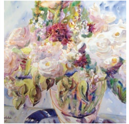
First Place Sandra Walsh Bountiful